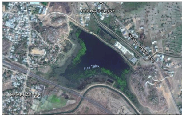
Fig. 1: A satellite view of Nav Talav, Amgaon in Gondia district of Maharashtra