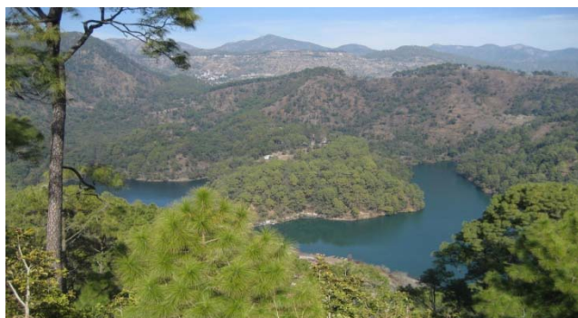
Fig. 6: A view of Sattal lake