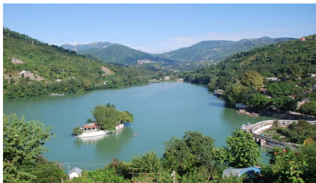
Fig. 4: A view of Bhimtal lake