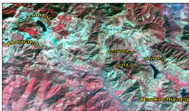
Fig. 1: A satellite view of lakes of Uttarakhand

where sun light stimulates algae growth, total nutrient concentrations may be higher than those deeper in the lake. These high total concentrations reflect the increased concentration of organic matter, because the organisms are utilizing most of the nutrients that are produced, available nutrient concentrations may be low. Since decomposition of organic matter formation of available nutrients from total nutrients occurs to a larger extent near the bottom of a lake, available nutrient concentrations may be higher at depth. The main source of nitrate is the runoff and decomposition of organic matter. The higher inflow of water and consequent land drainage causes high value of nitrate (Thilanga et al. , 2005). The higher concentration of nitrates is indication of level of micronutrients in water bodies and has ability to support plant growth. Higher concentration of nitrate favored growth of phytoplankton.