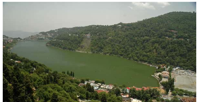
Fig. 3: A view of Nainital lake

drinking purpose by inhabitants of Kumaun region.